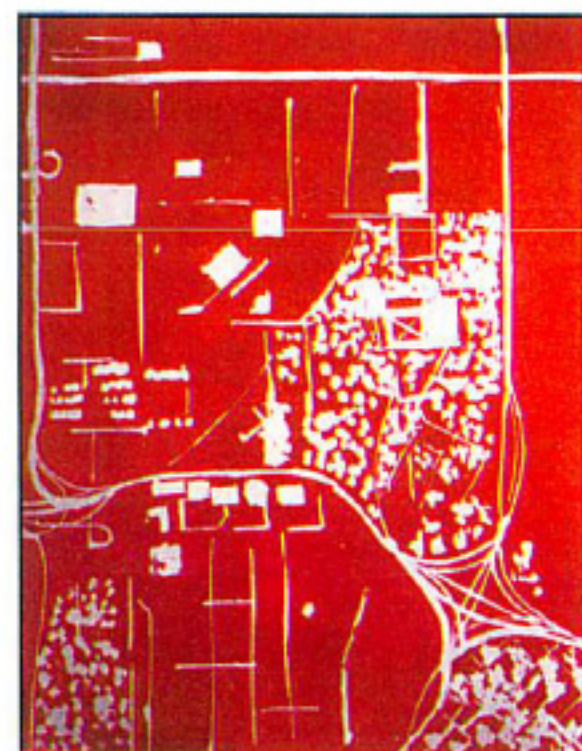
Density Map Birmingham